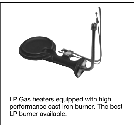
LP Gas heaters equipped with high performance cast iron burner. The best LP burner available.

NEW LOW CONSUMPTION PILOT USES LESS B.T.U.'S